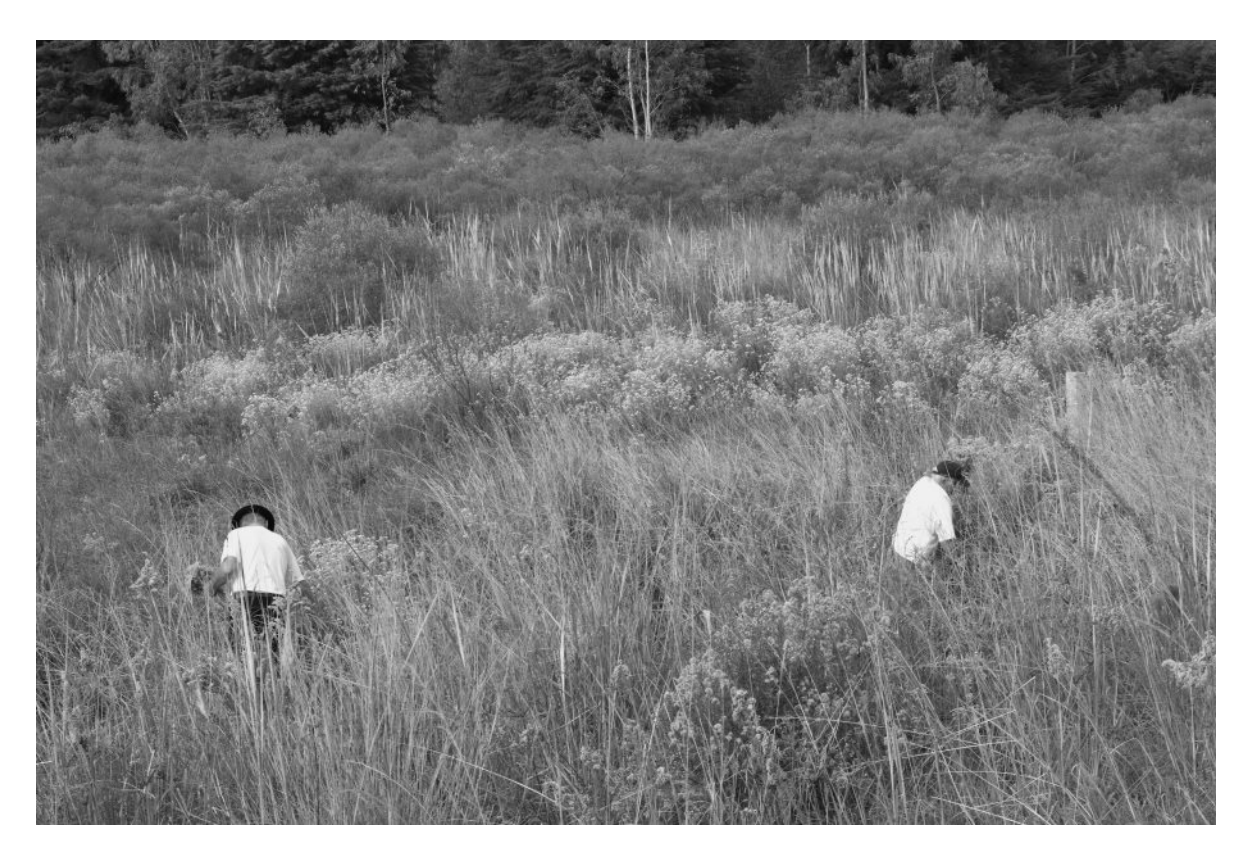
Figure 3: Harvesting of Achyrocline satureioides on the last Sunday of "Holy Week" in the vicinity of Rivera city, Rivera, Uruguay.

diversity than the alien ones for the whole sample (Fig. 4b). However, in discriminating the rural environments of the urban, the former reported a greater number of native medicinal plants (Fig. 4c) and the latter reported a greater number of alien medicinal plants (Fig. 4d).