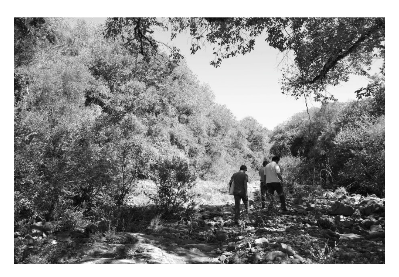
Figure 2: Walking and participant observation in medicinal plants harvesting near Lunarejo stream.

edulis, Ephedra tweediana, Jodina rhombifolia. Uncaria tomentosa. Scutia buxifolia (Table 1). It is important to highlight the harvest of Achyrocline satureioides. This medicinal plant is harvested on the "Palm Sunday" in Uruguay, which is located between the last week of March and the first weeks of April. On this religious date, people go to the sites where wild populations are found and collect a bouquet that will remain in the house throughout the year, being replaced next year, with the next harvest. It is highlighted that people consider that the species collected on this date has greater effectiveness (Fig. 3).