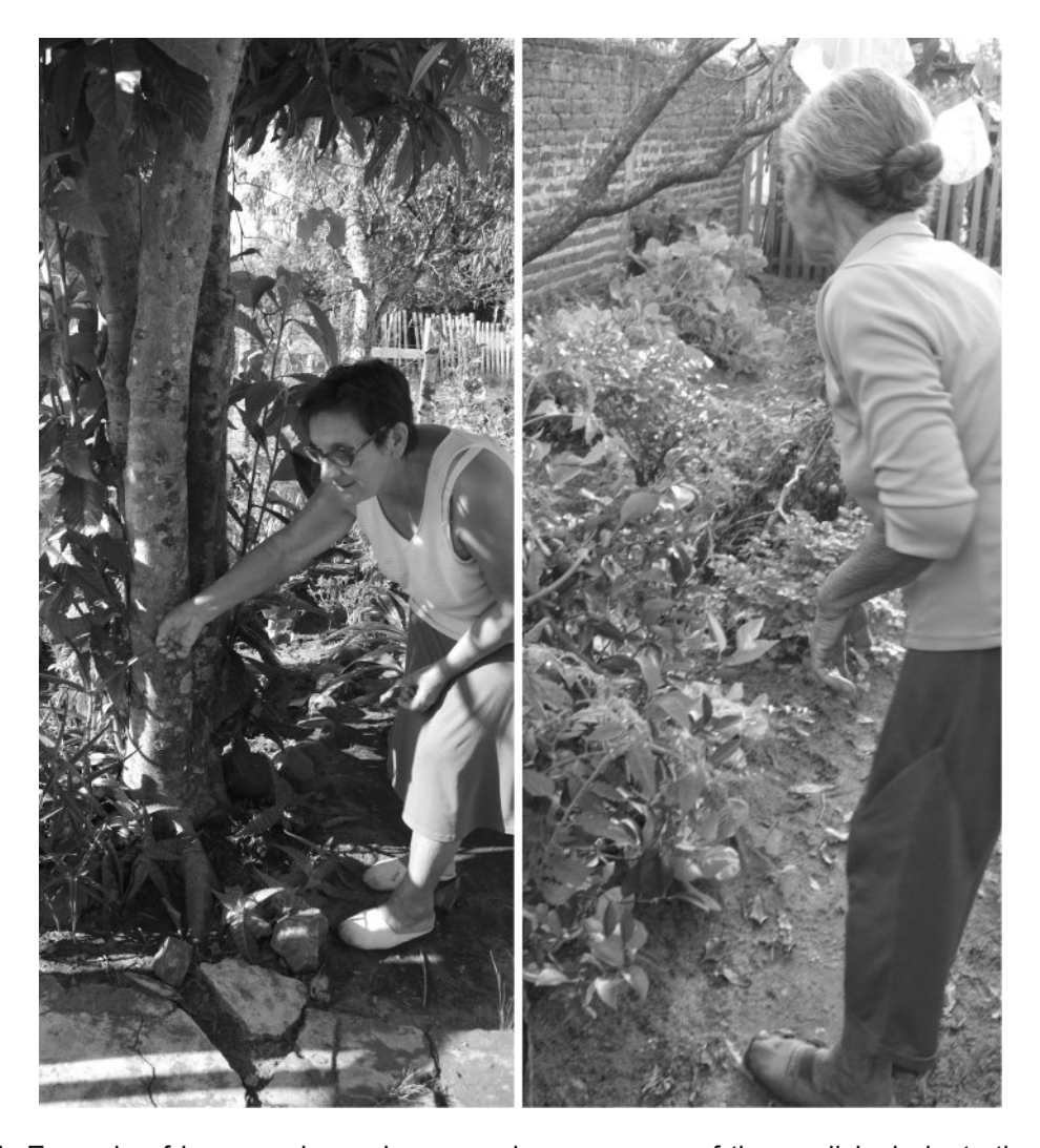
Figure 1: Example of homegardens where people grow some of the medicinal plants they use and exchange.

family, which develops farming and smallscale cow and sheep farming. Their houses are made of bricks, they have electric power and potable water, near the houses there are small subsistence homegardens and in some cases they develop bigger crops of watermelon (Citrullus vulgaris), sweet potato (Ipomoea batatas), tabacco (Nicotiana tabacum), lettuce (Lactuca sativa) and chard (Beta vulgaris var. cicla). Around their dwellings and in the homegardens they cultivate other plants that are used for medicinal purposes.